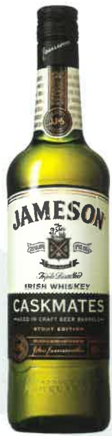
JAMESON CASKMATES IRELAND IRISH WHISKEY 700mL

Jameson has created this great new style that has been aged in old stout barrels. This has added extra cocoa and coffee notes to the renowned silky smooth Jameson Irish Whiskey - enjoy!