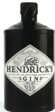
HENDRICK'S SCOTLAND GIN 700mL

Hand crafted from eleven botanicals and infused with rose petal and cucumber, this is one of the world's great gins. Remarkably fresh yet flavoursome, perfect with tonic and a slice of cucumber.