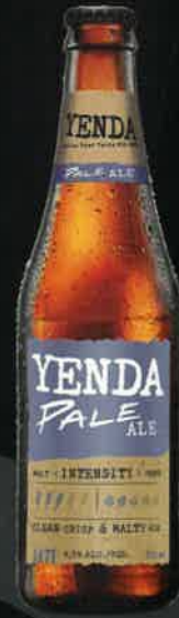
YENDA PALE ALE 330mL

The Australian Brewing Co. is a relatively new kid on the block making some wonderful beers that are perfect for the Australian way of life. This Pale Ale is a fruity, clean style with well-balanced malt and hops. Great as a thirst quencher yet bold enough to compliment spicy foods.