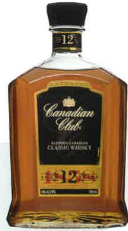
CANADIAN CLUB 12YO BLENDED CANADIAN CLASSIC WHISKY 700mL

Aged for an extra 6 years, CC 12-year-old takes on more of the oak barrel characters to create a richer, more robust whisky. Perfect for either sipping straight or mixing in your favourite drink.