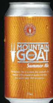
MOUNTAIN GOAT SUMMER ALE 375mL

A brilliant new addition to the Goat family that is growing bigger by the day. The Summer Ale has loads of malted and unmalted wheat in the brew and is topped off with big, fruity hops from New Zealand. It has a great balance between flavour and bitterness, which makes it a great refreshing beer all year round – not just in summer!