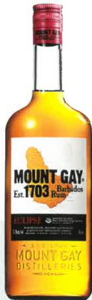
MOUNT GAY BARBADOS ECLIPSE RUM 700mL

Made for more than 300 years, Mount Gay Barbados Rum is super-smooth with hints of apricot and banana combined with the subtle smokiness brought by charred oak barrels.